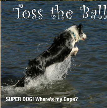
SUPER DOG! Where's my Cape?