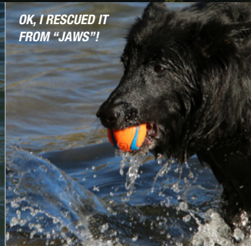
OK, I RESCUED IT FROM "JAWS"!