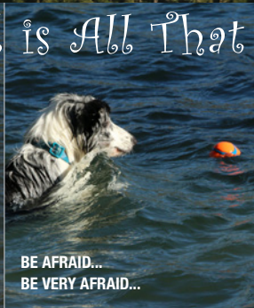
BE AFRAID... BE VERY AFRAID...