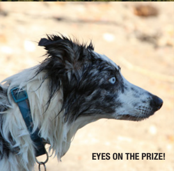
EYES ON THE PRIZE!