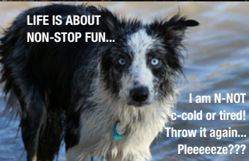
LIFE IS ABOUT NON-STOP FUN...